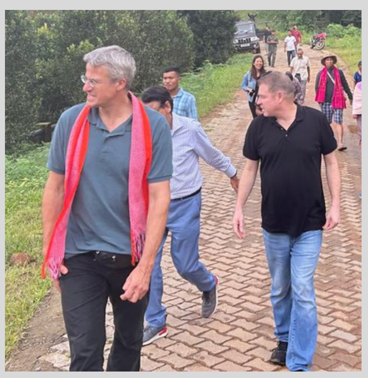
Team visit to Dura Kalakgre Village under Rongram Block , West Garo Hills District on the 8th Oct 2024 to witness the event of FPA Contest 3